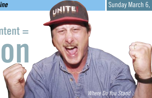
Where Do You Stand