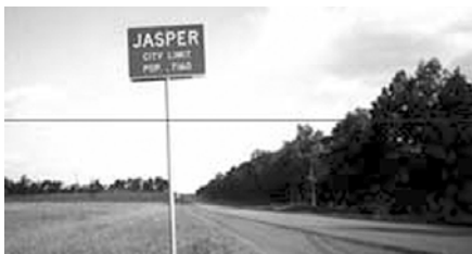
Two Towns of Jasper